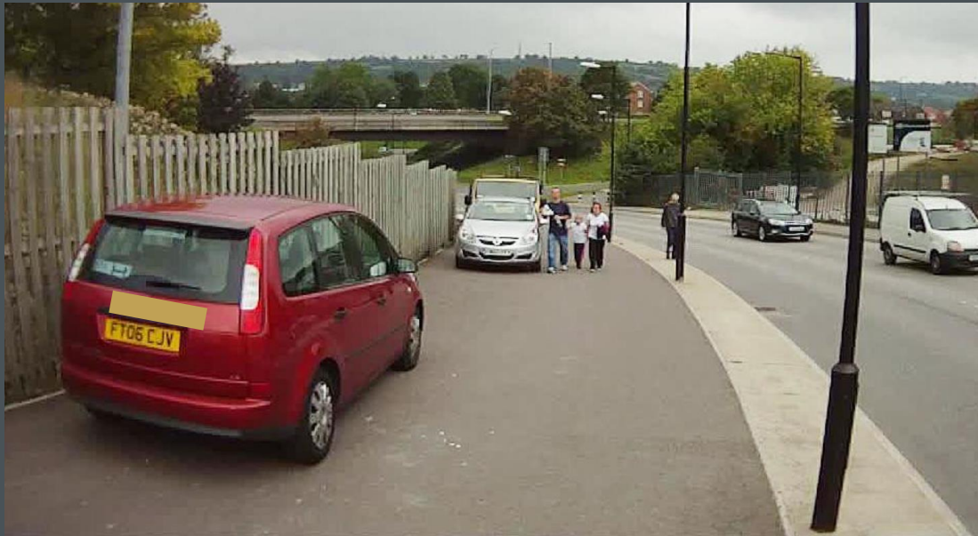
Vehicles parked on wide footway causing obstruction