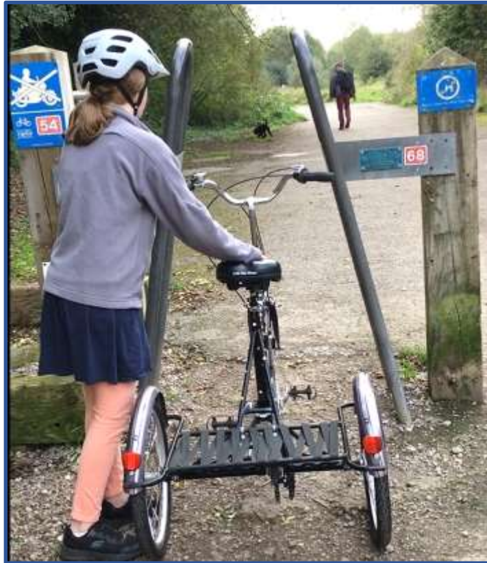
2023 - No access.